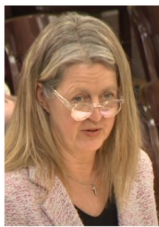
Roegner Testifies for SB 208

On the 27th the Senate Education Committee heard testimony from Senator Kristina D. Roegner (District 27) sponsor of Senate Bill 208. Her bill would amend the Ohio Revised Code to require a city, exempted village, or local school district to include in its open enrollment policy an exception for military children.